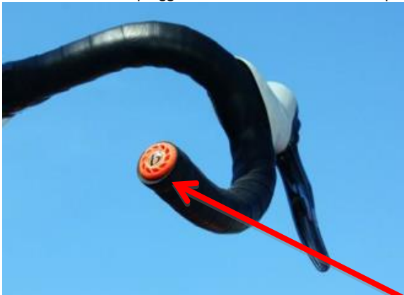
Bar end plugged or taped.